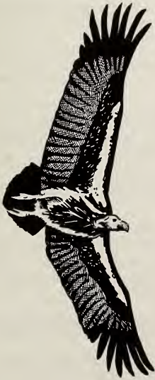
Lappet-faced Vulture Torgos tracheliotos by Mark Andrews

Bubulcus ibis Cattle Egret; status: fairly common; rb/m rec: 6; sites: 6; # zones: 3; zones: 2, 4, 9; month: 6, 10, 11; altitude: 150–2,400